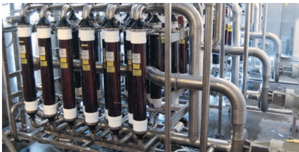
Woodbridge 3-stage Continuous WINEFILTER System

Woodbridge Winery needed an economical alternative to conventional wine filtration methods without sacrificing wine quality. Using conventional methods, wine has to be filtered in multiple steps. The excessive filtration often strips the red wines of flavor and color. Conventional methods also involve high labor, material, storage and disposal costs when compared to CMF technology.