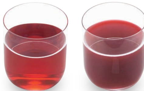
Feed 10 Brix