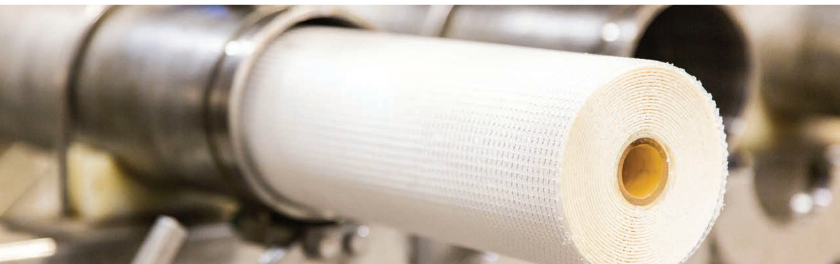
Final 50 Brix